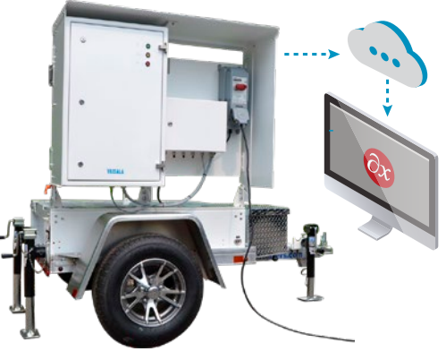
OPT100 Mobile Solution used with TOA Software

Once an initial assessment of the health of the transformer is complete, the OPT100 Mobile can either remain for ongoing monitoring or it can be moved to another gassing transformer identified through lab sample interpretation.