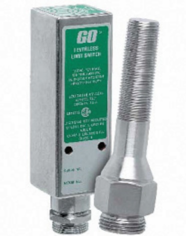
The magnetically driven TopWorx GO Switch from Emerson provides reliable proximity sensing in demanding and extreme conditions.

By automating and optimizing maintenance, as well as data collection and delivery, discrete valve controllers like this also enhance safety. Proactive maintenance and preset safety alerts and alarms reduce the frequency of maintenance rounds, while remote monitoring of valve package condition curtails the